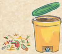
EM Fermented Food Waste Compost